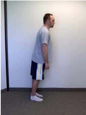
7 a. Lean forward

8. Walk on a treadmill. Progress to no hands only if someone capable is along side. Progress to using ankle weights.