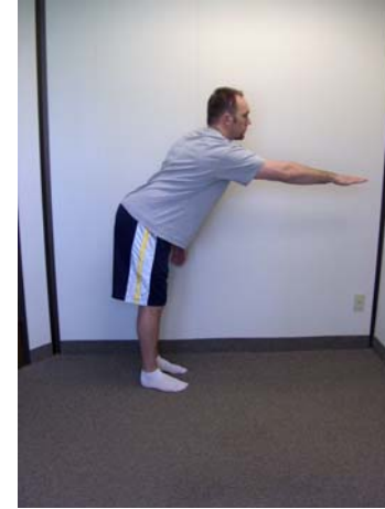
6. Limits of stability (forward)