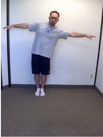
5. Limits of stability (side)