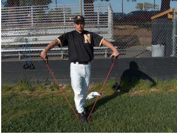
1. Empty cans.