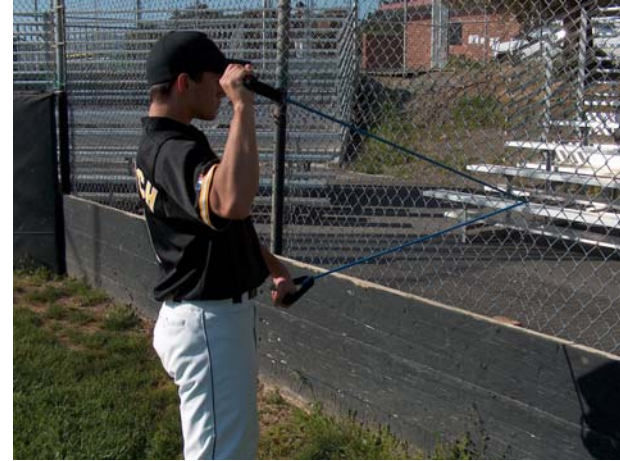
2. External rotation in abduction.