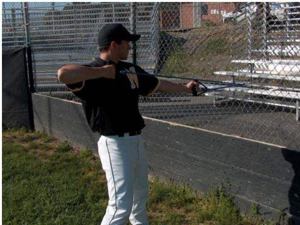
3. Bow and arrow.